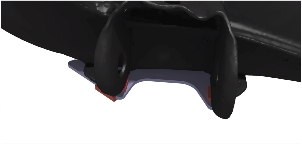
Image 9. Inner welds