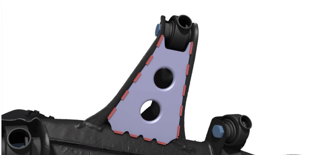
Image 6. Traction arm brace stitch welds