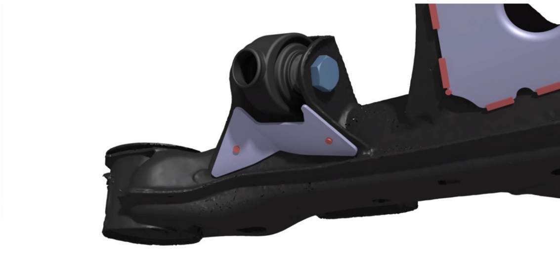
Image 10. Lower control arm front bracket brace plug welds