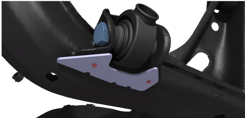
Image 7. Lower control arm rear bracket brace plug welds