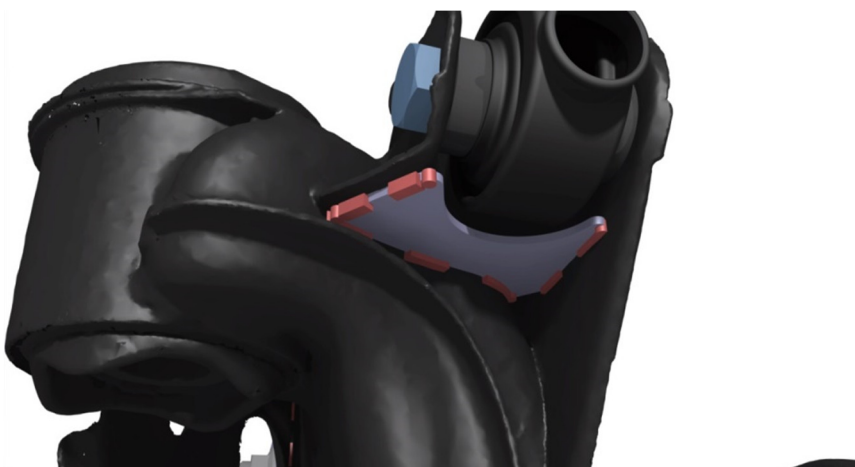
Image 4. Camber arm brace stitch welds