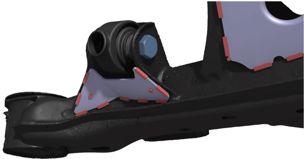
Image 11. Lower control arm front bracket brace stitch welds