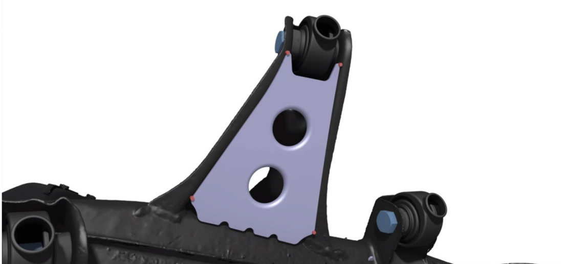
Image 5. Traction arm brace spot welds