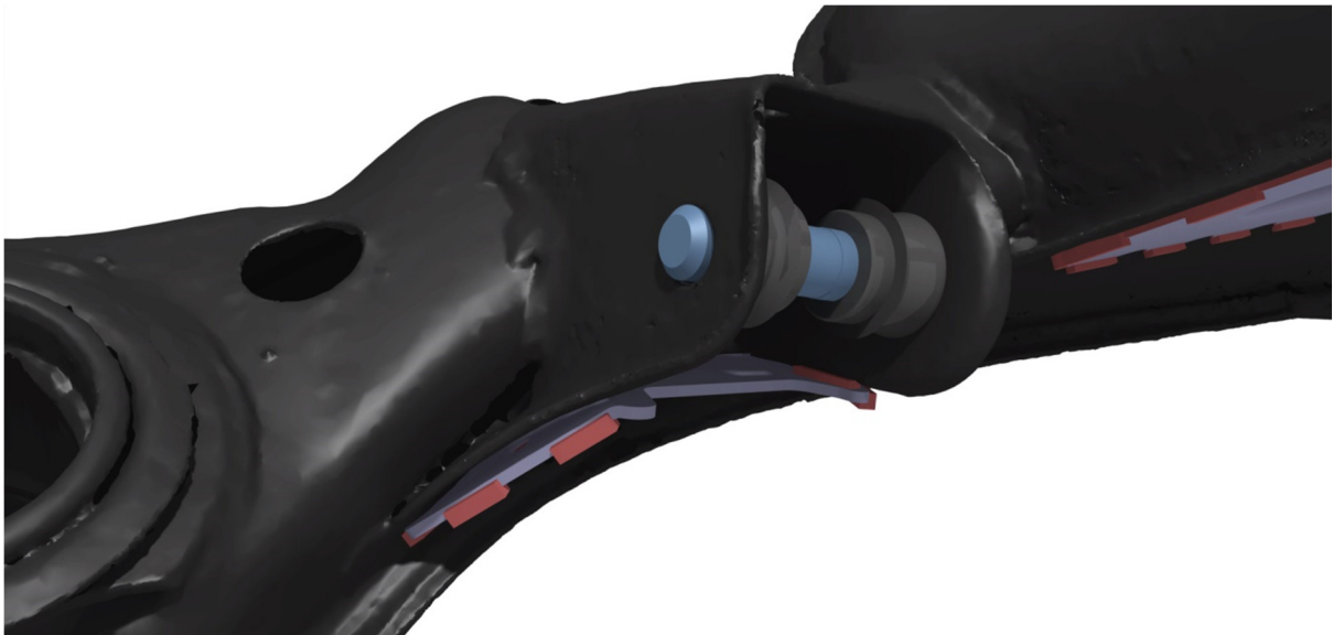
Image 12. Lower control arm front bracket brace inner stitch welds