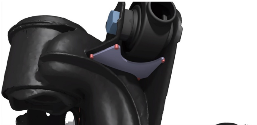
Image 3. Camber arm brace spot welds