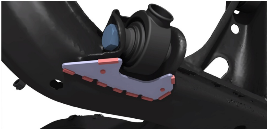
Image 8. Lower control arm rear bracket brace stitch welds